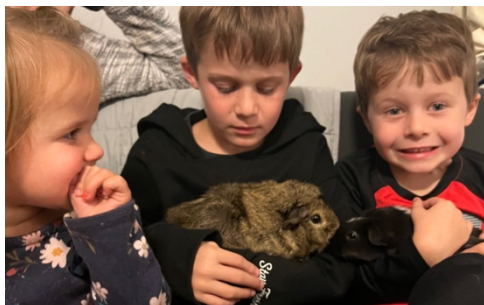
Kids with their guinea pig