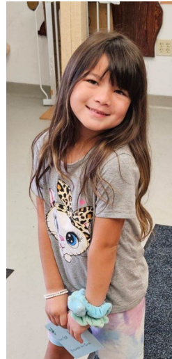
Lemonade Stand Donation