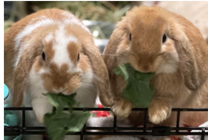
Bella and Penny