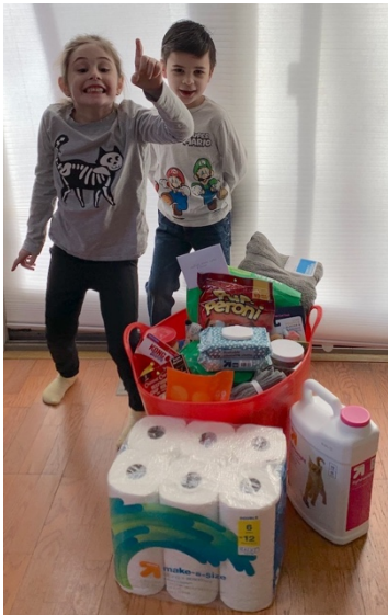
Donations Inspired by Athena