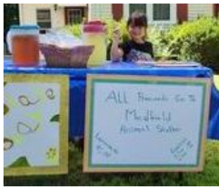
Lemonade Stand Donation