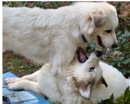
Casper and Bayly