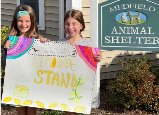
Lemonade Stand Donation