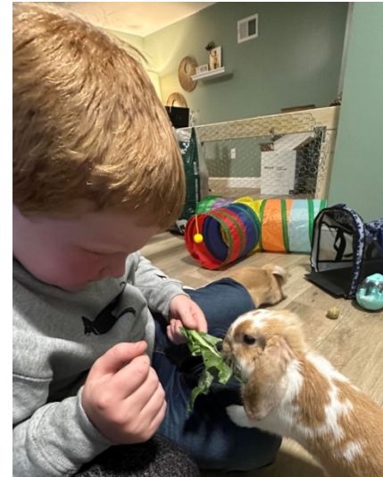
A boy and his bunny