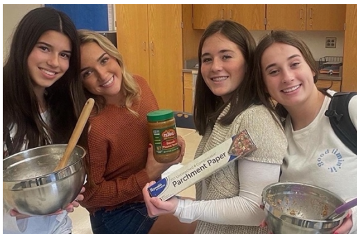
Franklin High Taste Buds dog cookies