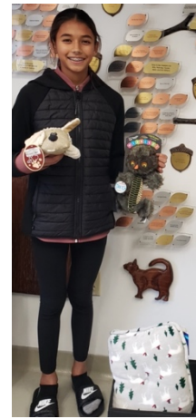
Donation of shelter supplies purchased with birthday money