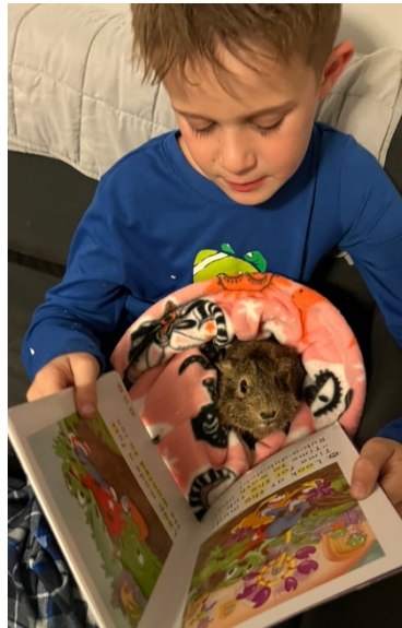
Reading to his guinea pig